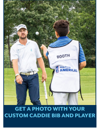
GET A PHOTO WITH YOUR CUSTOM CADDIE BIB AND PLAYER