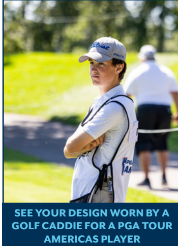
SEE YOUR DESIGN WORN BY A GOLF CADDIE FOR A PGA TOUR AMERICAS PLAYER