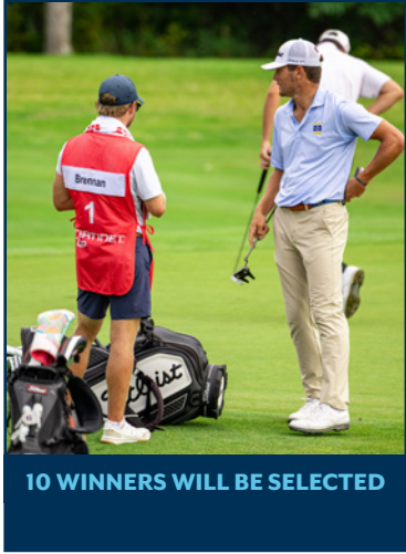
10 WINNERS WILL BE SELECTED

Kids in grades K-6 are invited to show off their creativity for a chance to have their artwork featured on an official caddie bib during the CRMC Championship, August 27th-30th, 2026!